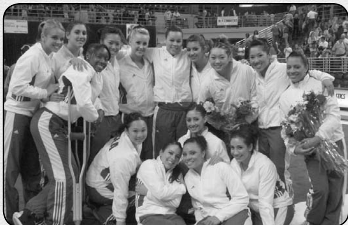
The Bruins qualified to the NCAA Championships for the 24th time in program history.