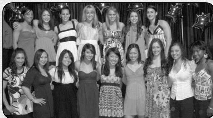
Bruins at the NCAA Championships banquet.