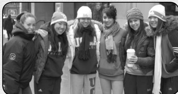
All bundled up in Chicago