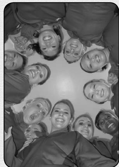
Inside the team huddle