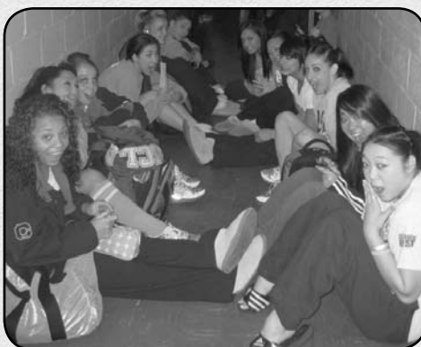
Riding out a tornado watch in the basement of the hotel just before the competition at Georgia