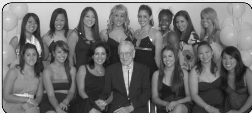
With Coach Wooden